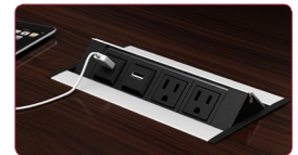
tables may be powered and are available with electrical popups