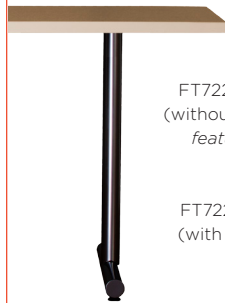
FT7224NTT-PV (without modesty) featured left