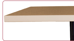
1-1/4" laminate top, M3 commercial grade wood core (45#-48# density)