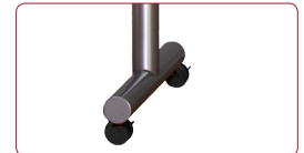
for mobile tables insert "M" before table size example FTM6024SCC-PV