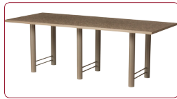
rectangular shaped table HET8436-PV