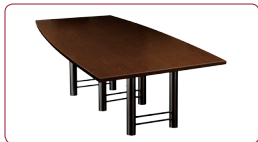
boat shaped table HETB10848-PV