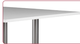
1-1/4" laminate top, M3 commercial grade wood core (45#-48# density)