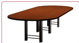
race track shaped table HETRI2042-PV