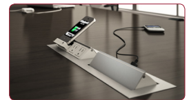
tables may be powered and are available with electrical popups

Add "R" after HET for race track shaped top