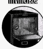
This concealed safe unit is a patented Invincible EXCLUSIVE!