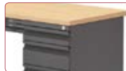
Unique pedestal design includes a PENCIL drawer, box drawer, and file drawer.

available in 48, 54 and 60 wide 24 and 30 deep