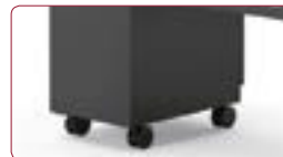
fully exposed 3" casters allows easy access to caster locks