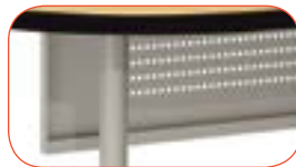
perforated modesty back panel (no angle)