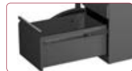
one-piece multi-formed 22ga cold rolled steel pedestal body 18ga bottom welded to the jacket