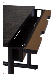
table features a 6" deep flip lid in the rear to allow access to the power and wire management channel

Available with a wide variety of power options (contact the Factory) in addition to pop up units that may be ordered with power, HDMI or USB ports, etc.