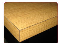
-SE = self-edge

tables may be powered and are available with electrical popups