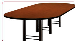
race track shaped table HETR12042-PV