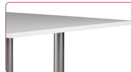
1-1/4" laminate top, M3 commercial grade wood core (45#-48# density)