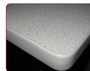
-TE = T-mold

PVC edge standard other edge treatments available by special request