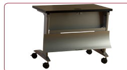
flip compartment stows electrical wiring