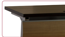
1-1/4" laminate top, M3 commercial grade wood core (45#-48# density)