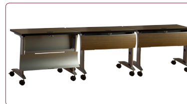
may be ganged see backside for enlarged image