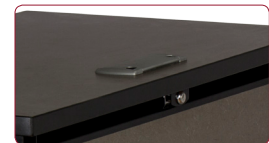
tables may be powered and are available with electrical popups