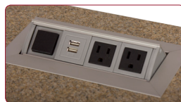
laminated tables may be powered and are available with electrical popups